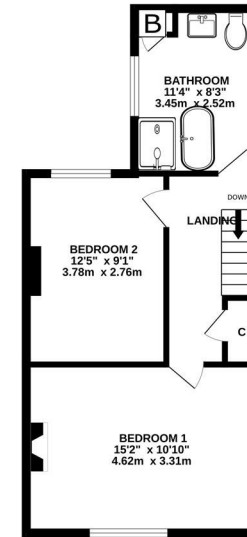
TOTAL FLOOR AREA: 923 sq.ft. (85.8 sq.m.) approx.

While every attempt has been made to ensure the accuracy of the floorplans contained here, measurements of doors, windows, floors and any other items are approximate and no responsibility is taken for any errors or omissions in the floorplans. This plan is for illustrative purposes only and should be used as such by any prospective purchaser. The services, systems and appliances shown have not been tested and no guarantee is given regarding their operation or efficiency can be given. Made with Metapix 7.0.2.0.26